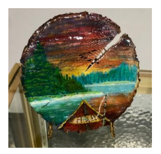
#038-Quiet Moments, by Barak Pinnon of Caulfield, MO

In the Photography Category, the winners are: