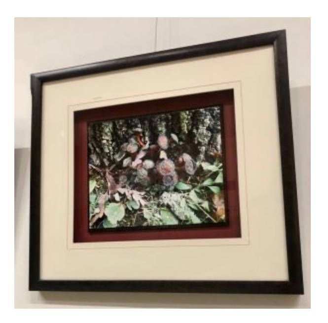
2nd Place: #015- Fungus Among The Fungus by Allen Hampton of West Plains, MO