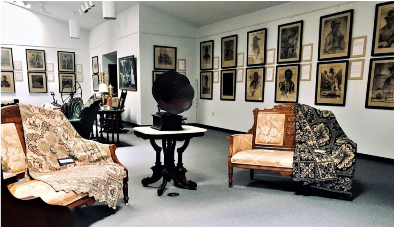
Antique Phonograph, Hand-Woven Hand-Dyed Textiles, & the Broadfoot Collection on display for the annual Ozark Heritage exhibit.