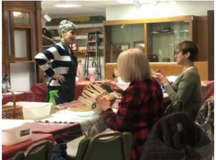
A Lost Arts: Basket-Weaving workshop in the Harlin's lower-level classroom area.

Take a look at our MUSEUM NEWS page for the most recent goings-on at the museum, including announcements about upcoming art shows, regional history exhibits, show competitions, and instructional workshops.