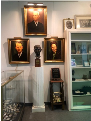
The Harlin Family portraits greet visitors to the museum.