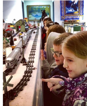
West Plains Elementary School classes enjoying the December Model Train show.

The Harlin Museum is dedicated to preserving our Ozarks' rich cultural heritage while also supporting the patronage of our innovative regional art scene.