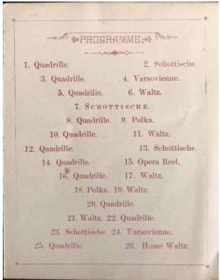
Inside Back Page of Grand Opera House Opening Ball Invitation

Also included, on the facing inside page, can be found the order in which the many different types of dances planned for the evening would be played: