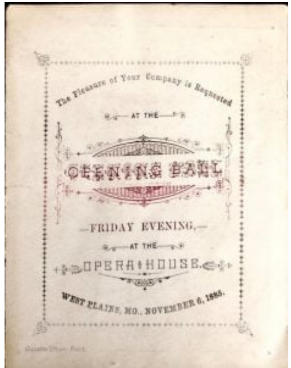
Front Cover of Grand Opera House Opening Ball Invitation