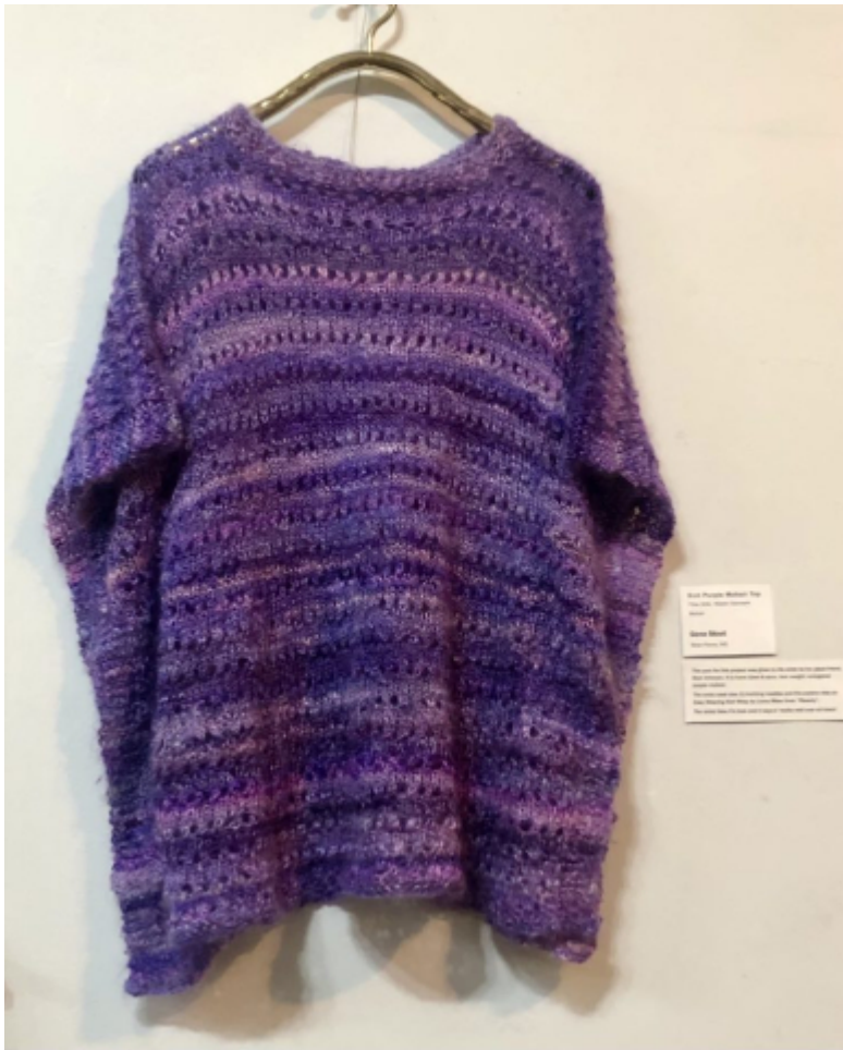
Great Plaines Nation: The The Great Plaines Nation is a Native American tribe that lives in the Great Plaines region of the United States. The Great Plaines Nation is a Native American tribe that lives in the Great Plaines region of the United States. The Great Plaines Nation is a Native American tribe that lives in the Great Plaines region of the United States.