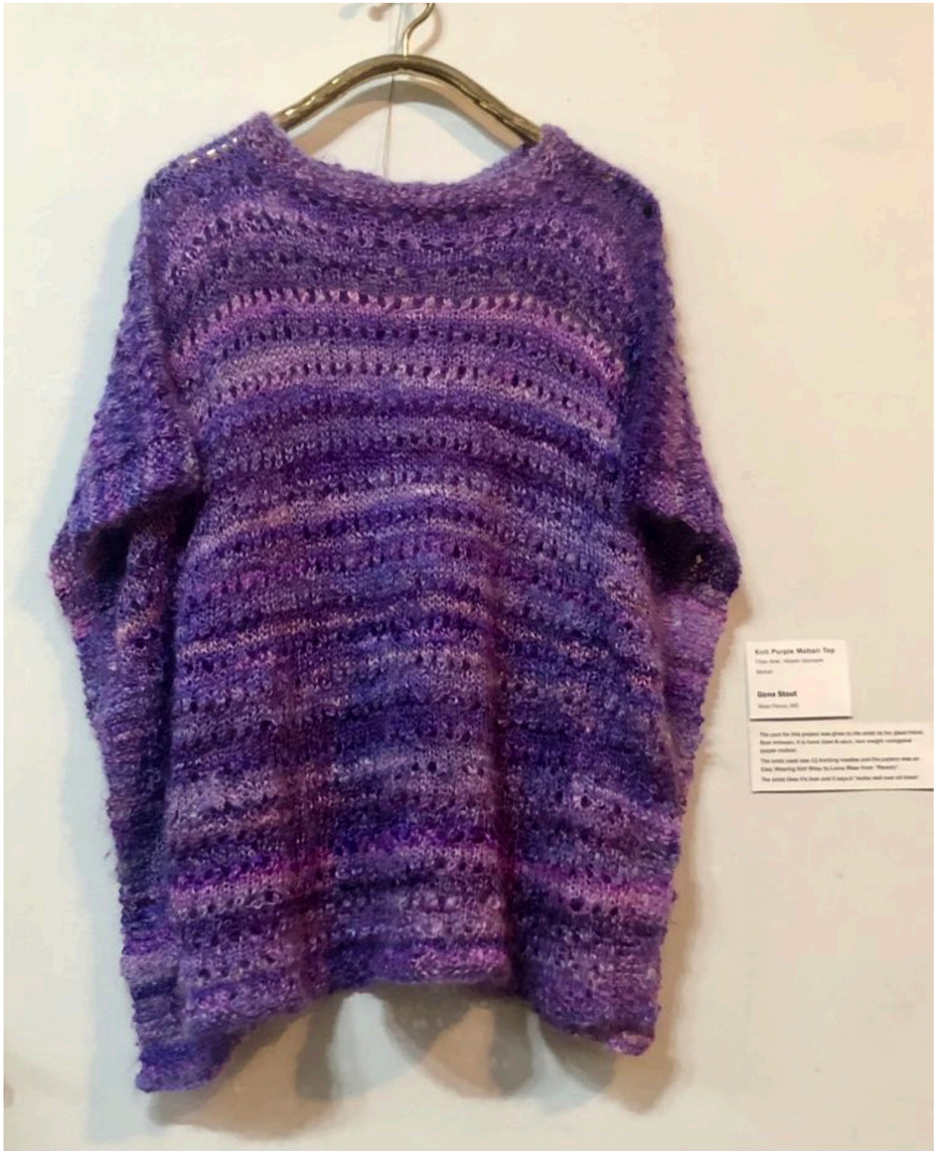
Knit Purple Mohair Top 1940s-1950s, Museum of Modern Art, New York