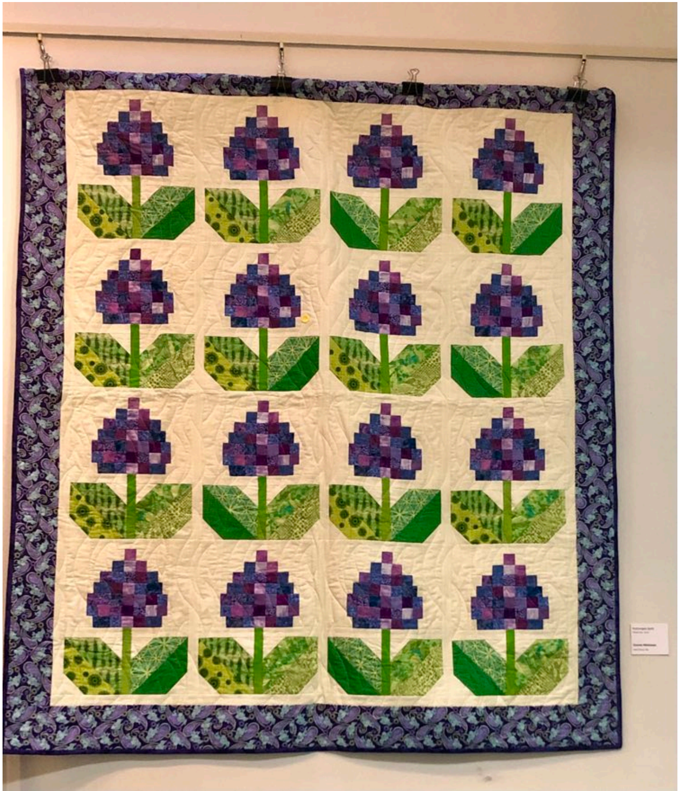
Stylized Flowers Quilted by [Name] [Address] [City, State, Zip]