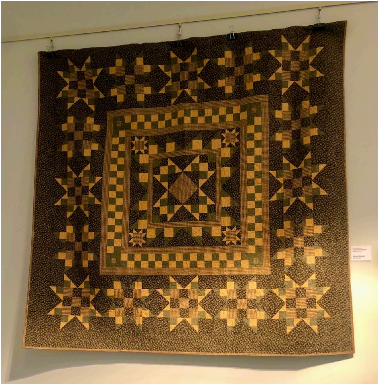
Quilt c. 1850-1860 American Museum of Art and History