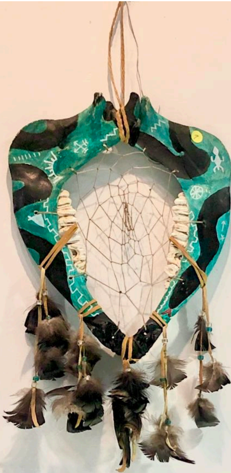
Dream Catcher Fiber Arts - Multimedia